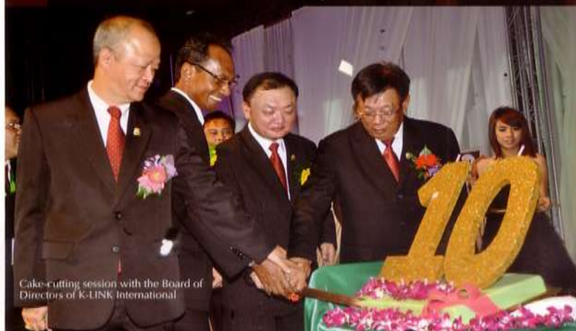
Cake-cutting session with the Board of Directors of K-LINK International