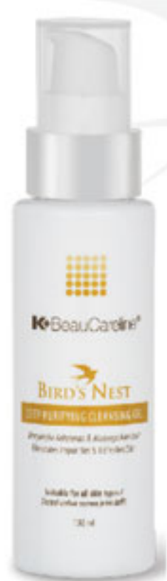
DEEP PURIFYING CLEANSING GEL Eliminates impurities & refreshes skin

K-BeauCareline® 燕窝胶原蛋白护肤系列 BIRD'S NEST Series