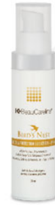
MULTI UV PROTECTION SUNSCREEN SPF 50 Moisturizes, softens & protects skin against UV rays

Besides that, all of you can detoxify your body using K-Ayurveda AyuDerme of K-LINK .