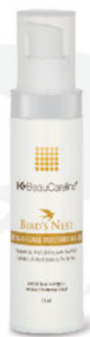
ULTRA-ESSENCE MOISTURIZING GEL Instant hydration, vitality & elasticity for the skin