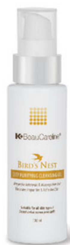
CLARIFYING TONING LOTION Revitalizes, reactivates & soothes skin