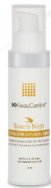
REVITALIZING ANTI-AGING SERUM Enhances skin cell reproduction, regenerative & nourishing